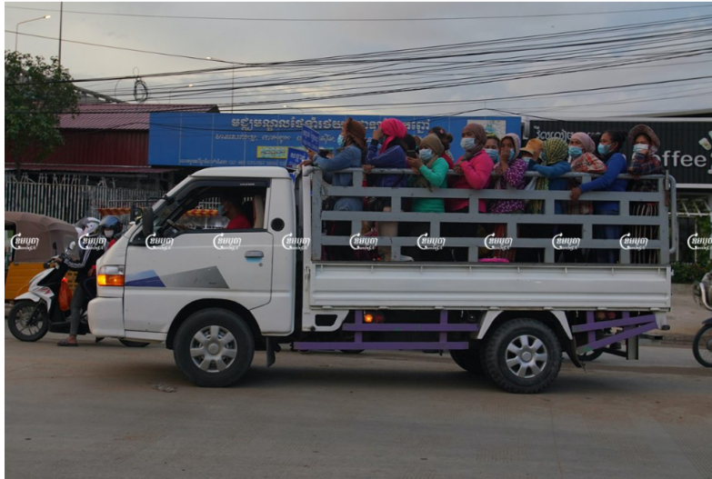
Garment workers travel by truck to factories in Phnom Penh, Cambodia/ Panha Chhorpoan