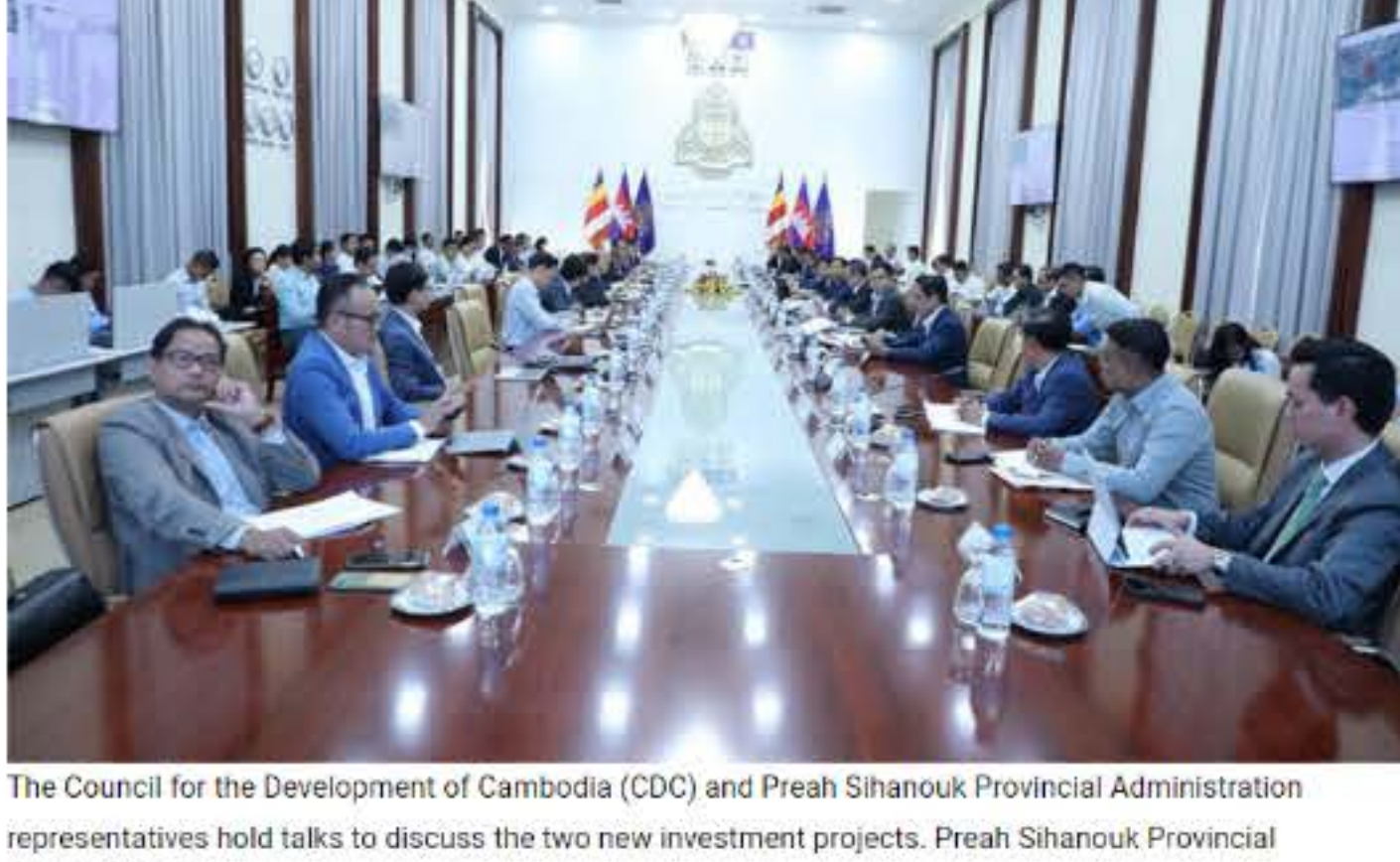
The Council for the Development of Cambodia (CDC) and representatives hold talks to discuss the two new investment projects.

Click here to get Khmer Times Breaking News direct into your Telegram