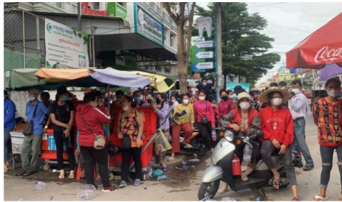
Workers gathering to protest in front of the factory.

Click here to get Khmer Times Breaking News direct into your Telegram