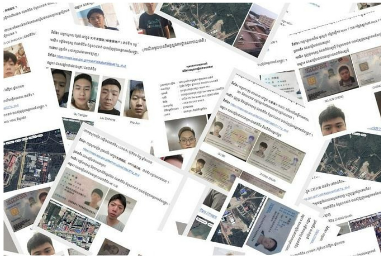
A photo posted by Interior Minister Sar Kheng on his Facebook on April 26, showing reports of alleged scam and human trafficking related cases and locations of alleged compounds.