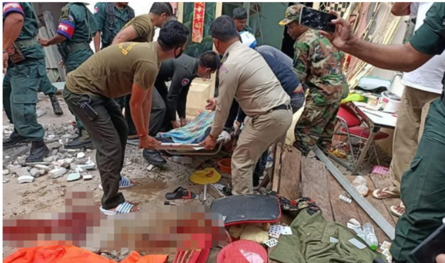
Police help move debris to rescue people trapped after the crane collapse in Poipet city yesterday.