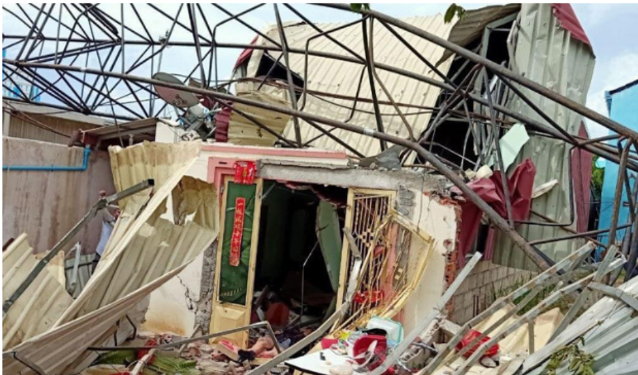
The destroyed house after the crane fell on it in Poipet city yesterday.