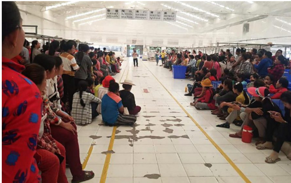
Factory workers gather for a strike at the Dignity Knitter factory in Kandal province on January 17, 2020.

[responsivevoice_button voice="US English Female"]