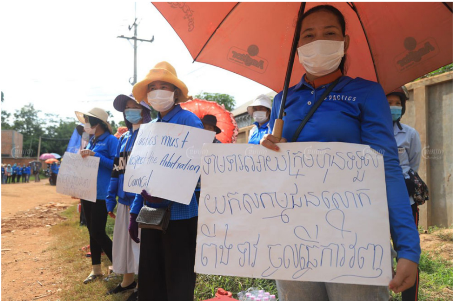
Employees of Pactics Company strike outside the factory on September 1, calling for the reinstatement of two fired union members. Panha Chhorpoan