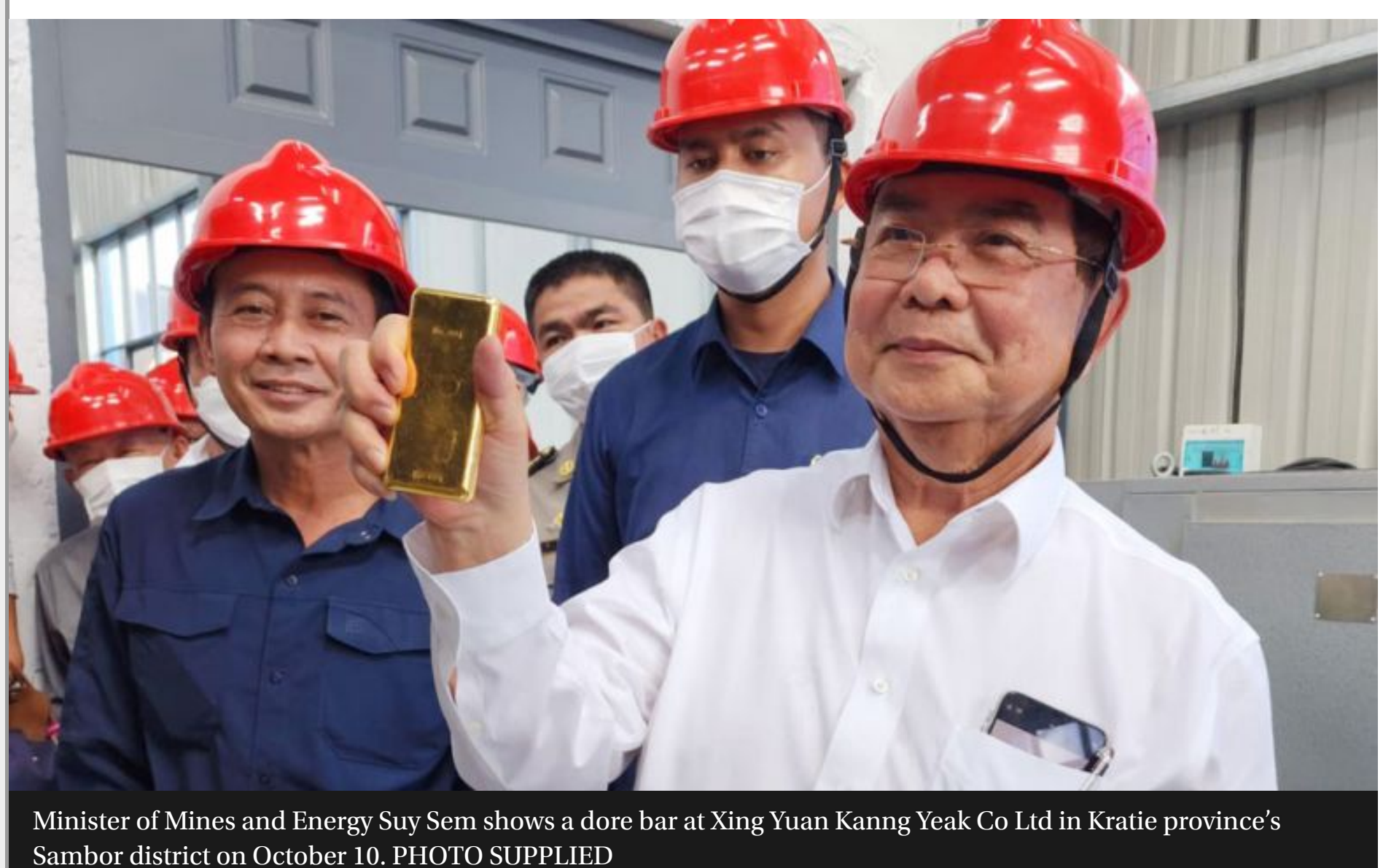
Minister of Mines and Energy Suy Sem shows a dore bar at Xing Yuan Kanng Yeak Co Ltd in Kratie province's Sambor district on October 10.

Cambodia's four official gold producers have pumped out more than 4.8 tonnes of dore bars – a semi-finished product that is smelted at a mine, usually at about 90 per cent purity – since the first commercial gold pour took place in June 2021, according to Minister of Mines and Energy Suy Sem on November 30.