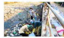
Youths band together to clean 'filthy' Boeung Trabek canal

Prime Minister Hun Sen has reminded civil servants and government officials as well as the general public who have already received first and second doses of the AstraZeneca vaccines that they should not use that vaccine again for their third, booster shot. Cambodia is starting