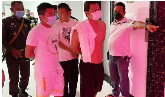
Some of those detained being led out of the premises

Click here to get Khmer Times Breaking News direct into your Telegram