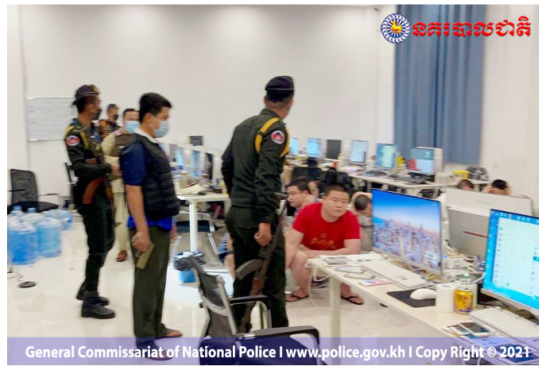
General Commissariat of National Police | www.police.gov.kh | Copy Right © 2021

Seven firearms, including three automatic rifles, several bulletproof vests and other paraphernalia were found and confiscated at the site.