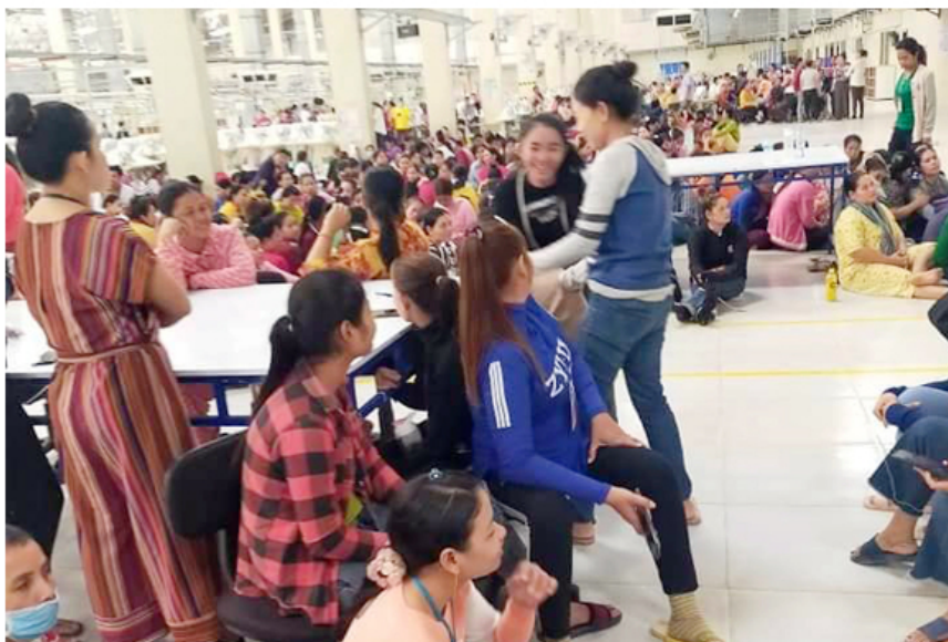
The workers claim that the owners agreed to terminate their employment contracts and give them their last month's wage. Facebook