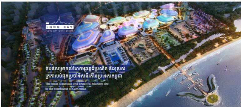
A promotional illustration of Long Bay at Dara Sakor, featured on Long Bay’s Facebook page.

Eight days later, the company sent the following statement on Tuesday: “The Cambodia Property Awards will not include Long Bay Century Hotel and Casino and Zheng Heng Co. Ltd. in this year’s shortlist across categories.”