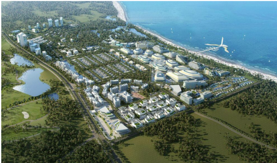
An illustration from Zheng Heng Group of its Long Bay development at Dara Sakor park in Koh Kong province.