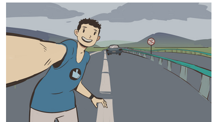
Illustration of the day: Likely to get hurt

It's official: the much cancelled on-again-off-again music extravaganza, Mozart at Angkor, is now definitely off again.