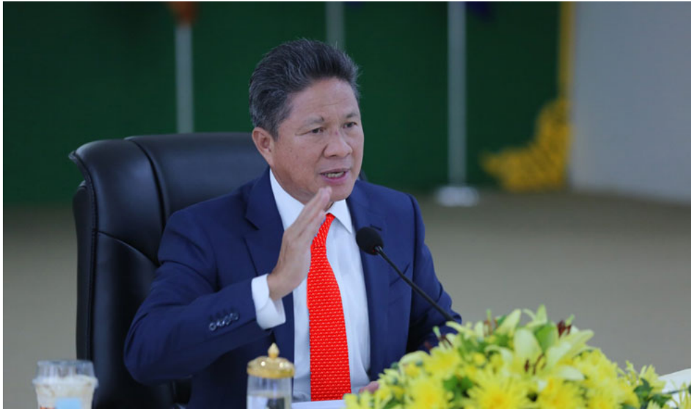
MPWT Minister Sun Chanthol speaking with senior officials and relevant stakeholders during a conference regarding the 38-road project.

Last January 29, Minister of Defense Samdech Pich Sena Tea Banh, with Director-General of the Electricite de Cambodge (EDC) Keo Rattanak, personally inspected the progress on the 38-road road project in Siem Reap. Officials report that the project is well on its way at 17% completion (as of last week of January) and on schedule to meet its year-end completion date.