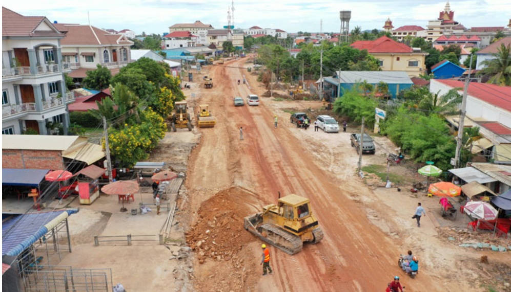
The 38-road project in Siem Reap is a massive undertaking designed to improve the city's tourism and overall economic prospects.

The 38-road project in Siem Reap is seeing significant progress since its groundbreaking in late November 2020. The infrastructure project is constructing and rehabilitating roads in the city along with building and repairing rainwater drainage and wastewater purification systems.