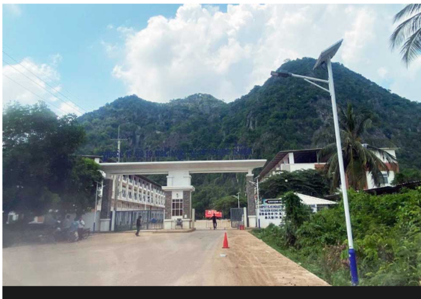
The Building and Wood Workers' Trade Union Federation of Cambodia (BWTUC) and the Centre for Alliance of Labour and Human Rights (Central)