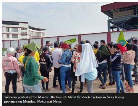
Workers protest at the Master Blacksmith Metal Products factory in Svay Rieng province on Monday.

More than 200 striking factory workers in Svay Rieng province have agreed to return to work and allow operations to resume after their employer promised to meet a list of demands.