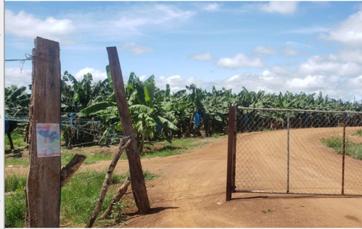
A banana plantation in Stung Treng province.

[responsivevoice_button voice="US English Female"] More than 200 Covid-19 cases have been found at a Ratanakiri banana plantation, according to an official, as some workers complained of poor conditions and that they were receiving no medication despite testing positive.