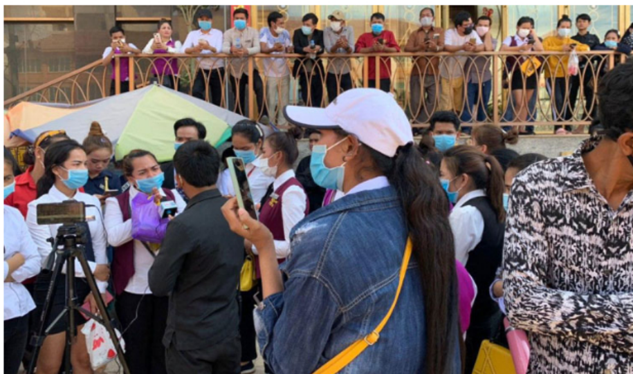
Yaduoli casino workers protest in Sihanoukville. KPS

Click here to get Khmer Times Breaking News direct into your Telegram