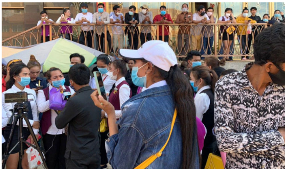
Workers of Yaduoli Casino stage a protest over their wages in Sihanoukville.