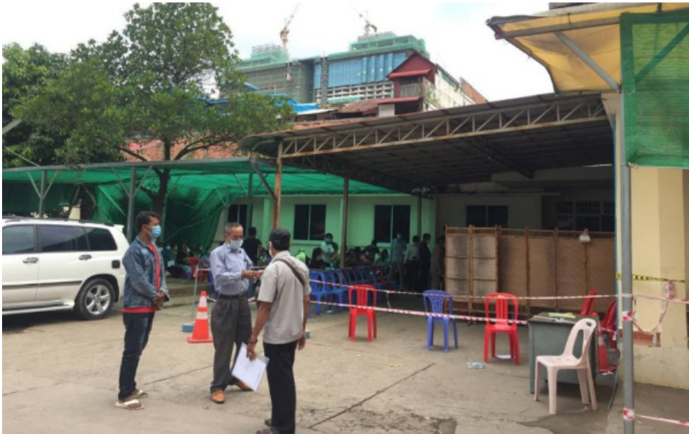
A vaccination drive at the Phnom Penh Municipal Referral Hospital.

[responsivevoice_button voice="US English Female"]