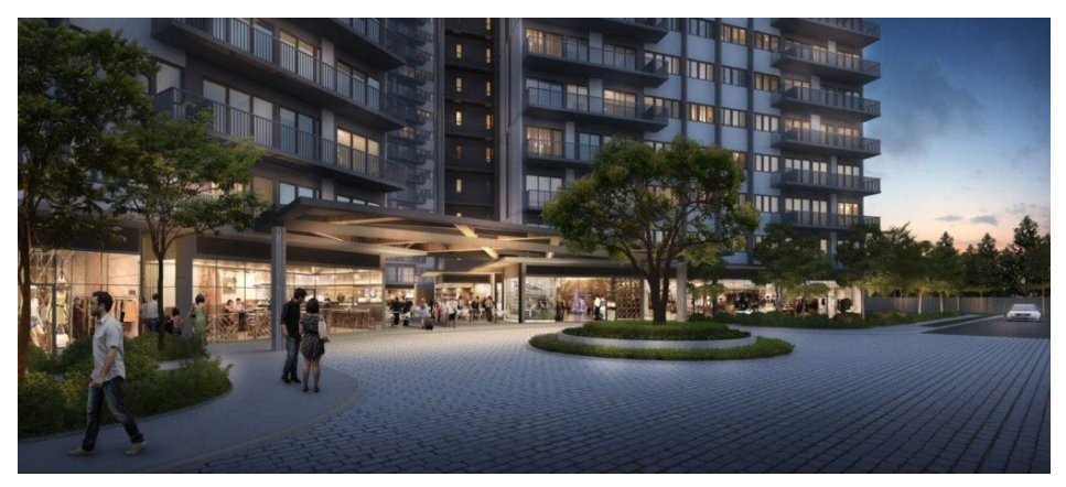
- Video Advertisement -