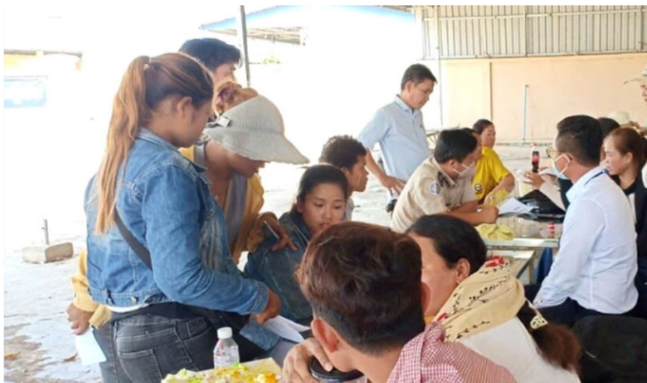
Representatives of workers meet with Labour Ministry officials over unpaid wages.

Click here to get Khmer Times Breaking News direct into your Telegram