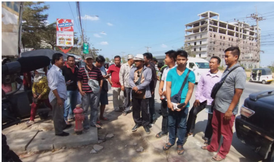
PassApp drivers gather to protest after a casino banned them from picking up passengers inside the company compound. Nokor Wat