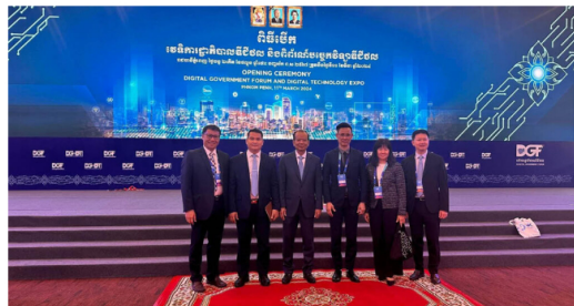
- Video Advertisement -