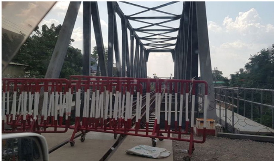
The closed Thai-Cambodian border is the subject of contention in the Poipet area.