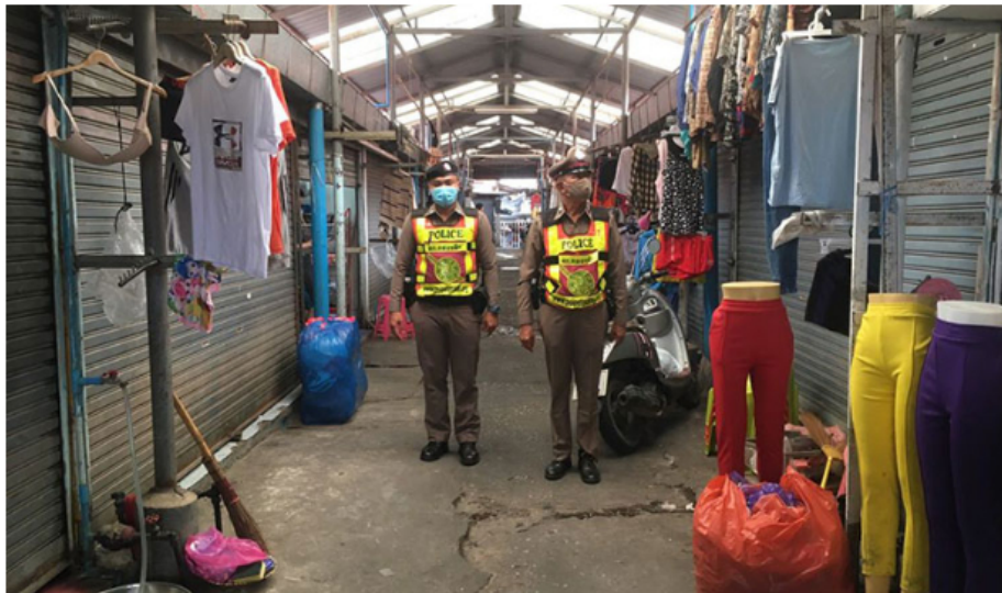
Police enforce strict measures at Rong Kluea Market, where Cambodian vendors used to sell their produce, in Aranyaprathet, Thailand.

Click here to get Khmer Times Breaking News direct into your Telegram