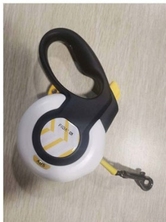
The product manufactured by one of the investment companies. CDC

ប្រភពផលិតសម្ភារៈ BEST-RUN TECHNOLOGY (CAMBODIA) CO., LTD.