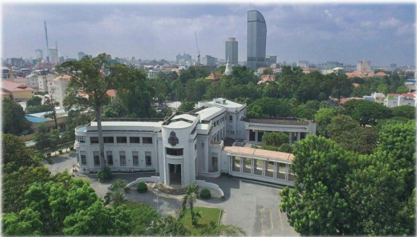
The Council for the Development of Cambodia on May 27 approved five new investment projects that will bring in 2,080 new jobs.