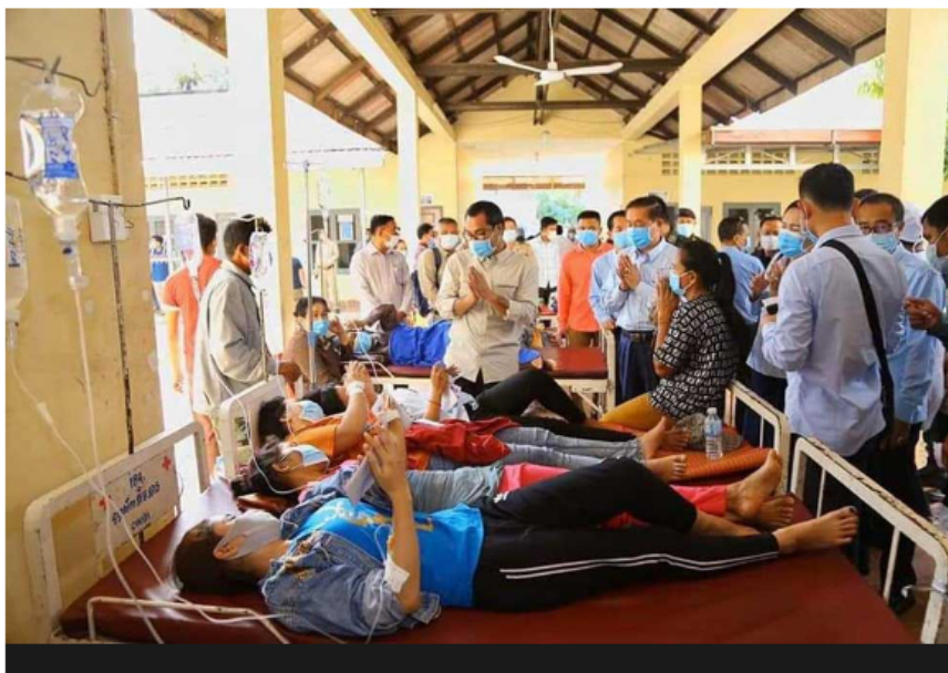
The families of garment factory workers who died in a traffic accident on National Road 1 on June 24 said on Monday that they will sue the company that