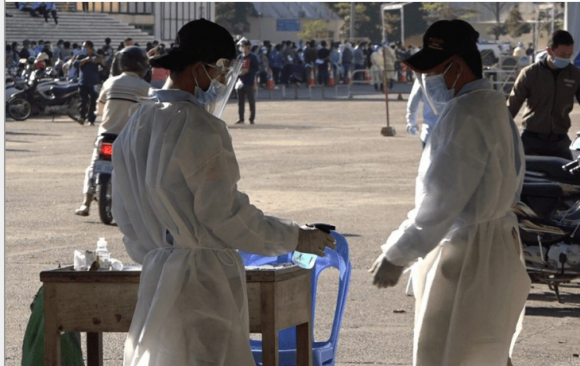
A health worker sprays alcohol sanitiser on a colleague at the Covid-19 testing center at Olympic Stadium in Phnom Penh on December 8, 2020. (Hy Chhay/VOD)

Casino workers who were placed in quarantine at their Kandal province casinos a week ago have tested positive for Covid-19 en masse, as local authorities defended the locations' security as being completely sealed off by soldiers and guards.