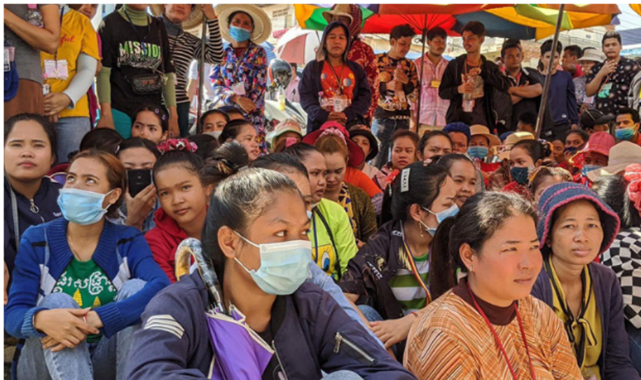
Workers of Quality textile factory protest demanding missing wages. CENTRAL

Click here to get Khmer Times Breaking News direct into your Telegram