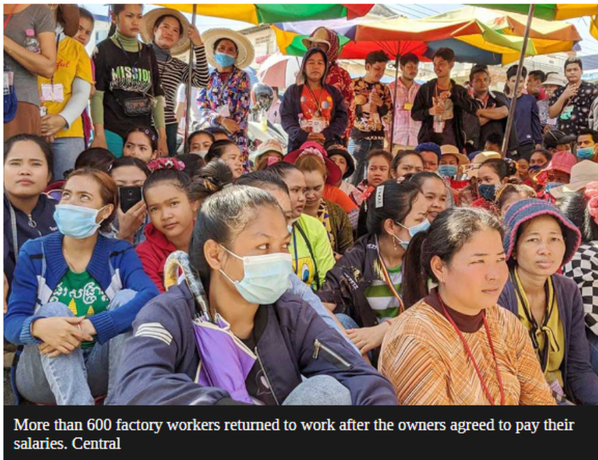
More than 600 factory workers returned to work after the owners agreed to pay their salaries. Central