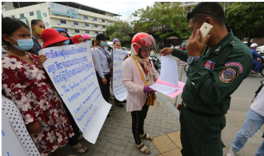
A security guard checks documents from protesting workers at the Ministry of Labour.

Click here to get Khmer Times Breaking News direct into your Telegram