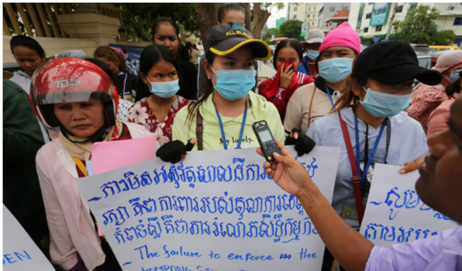
Workers from Kampong Speu province protest outside the Ministry of Labour over unpaid dues after the factory owner absconded.

“We are trying to find another job but at this time, some factories are suspended or shut down,” she said. “So we hope to get our last wages and compensation to pay debts, rentals and other living expenses.”