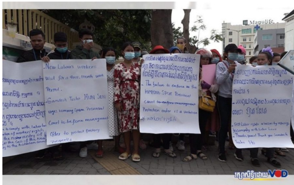
Employees of the New Best Global Textile factory in Kampong Speu province protest at the Labor Ministry in Phnom Penh on June 29, 2020, calling for compensation and other benefits.

[responsivevoice_button voice="US English Female"]