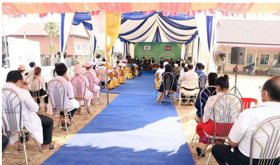
The ground-breaking ceremony of the maternal and infant healthcare project. AKP