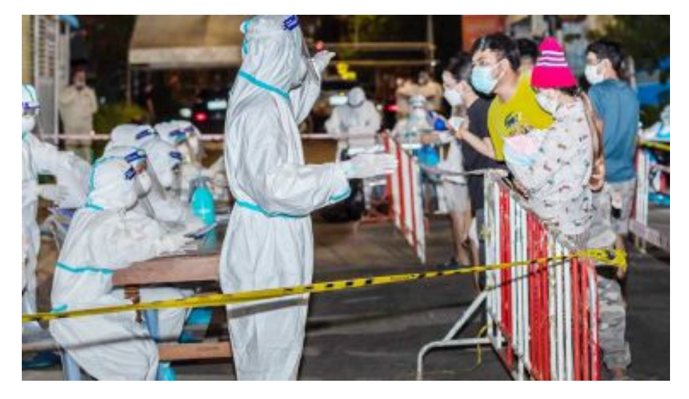
Delta spreading in Kingdom

Cambodia has so far detected more than 200 cases of the highly contagious coronavirus Delta variant, with 109 found on July 31 and August 1. The Ministry of Health has expressed deep concerns that the variant may have already reached communities and be spreading as some of the cases