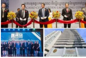
H.E Ph.D Hun Manet Congratulated Picasso City Garden Completion The Only Picasso-Themed Luxury Apartment in Asia is in Heart of Phnom Penh