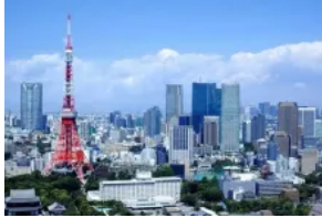
Ikea is offering a tiny apartment in Tokyo for less than $1 per month