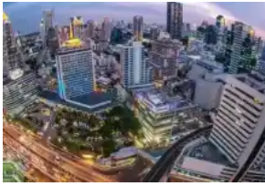
Noble bullish on property market next year