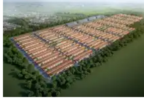
Satellite Serei Mongkul City project gunning for Dec 31 target