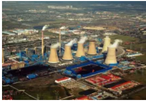
China's Nov factory activity likely contracted at a slower pace