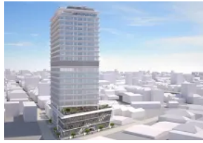
HOTEL NIKKO PHNOM PENH [OPENING 2024]