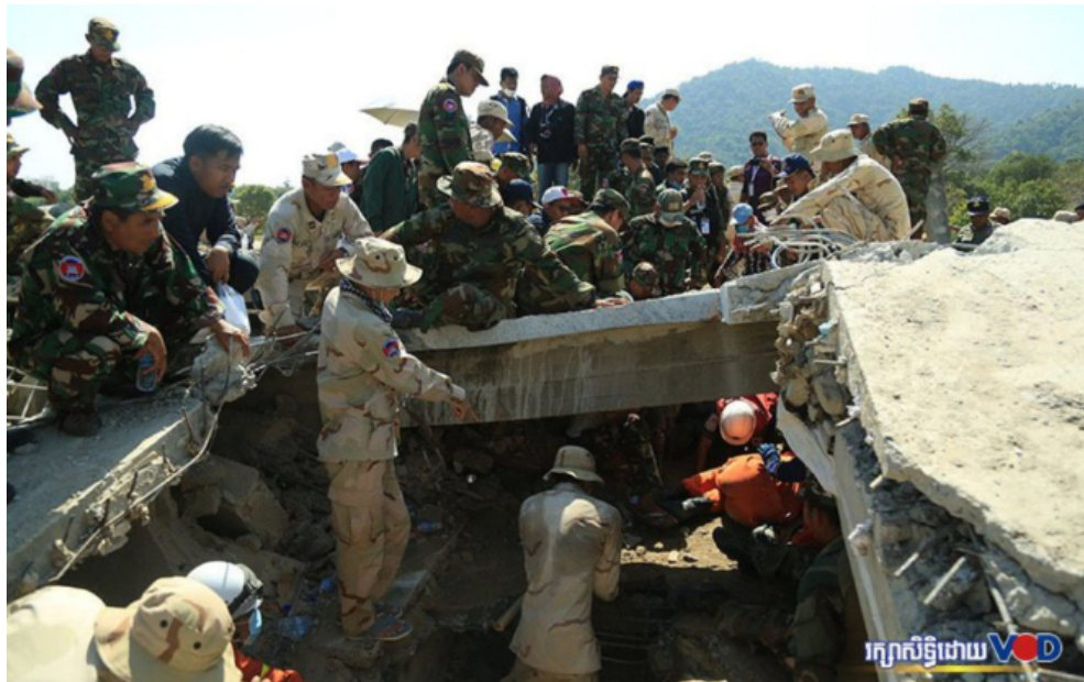
Rescuers search for survivors of a building collapse in Kep province on January 4, 2020.

[responsivevoice_button voice="US English Female"]