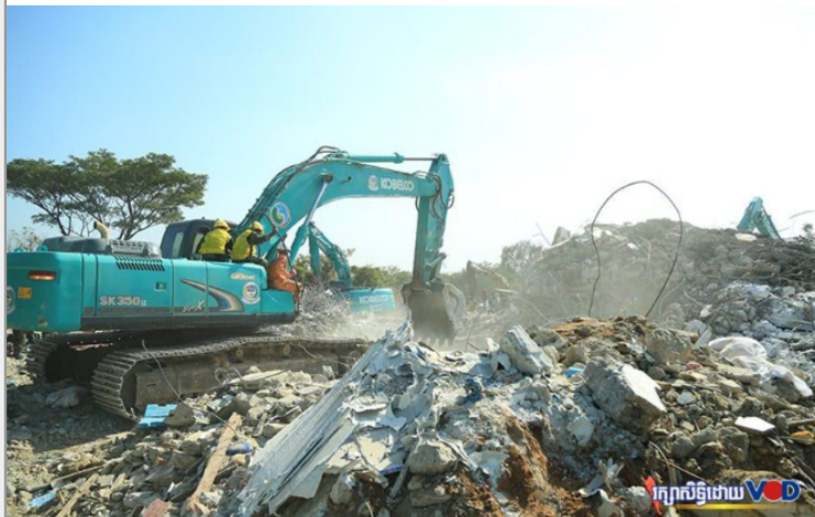
Rescuers search for victims under the debris of a collapsed building in Kep province on January 3, 2020.

[responsivevoice_button voice="US English Female"]