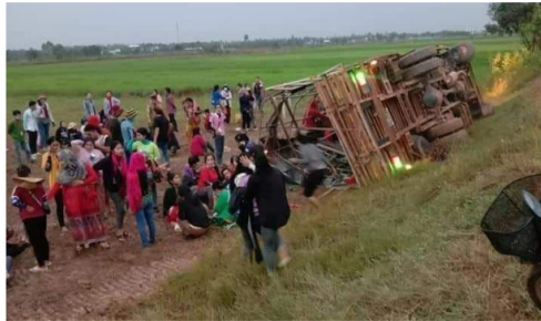
A truck carrying factory workers overturned, injuring several factory workers in Takeo province. Post News

Click here to get Khmer Times Breaking News direct into your Telegram