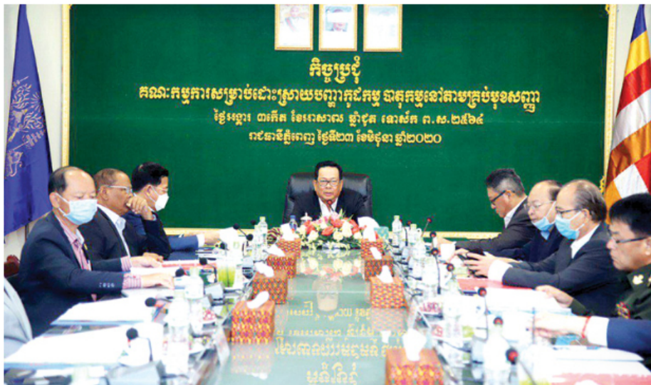
Labour Minister Ith Samheng presides a meeting which seeks to find a solution regarding widespread protests of displaced workers.

Click here to get Khmer Times Breaking News direct into your Telegram