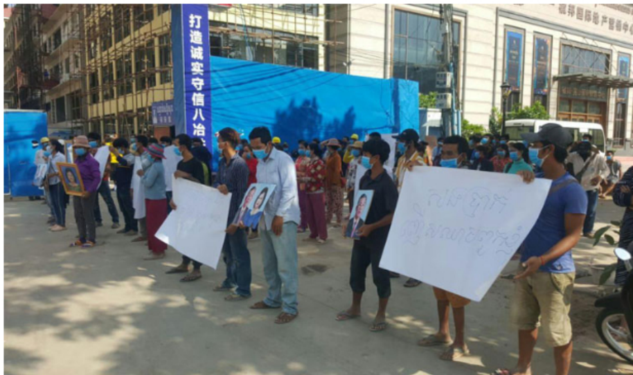
The construction workers protesting over missing wages in Chamkarmon district.

Click here to get Khmer Times Breaking News direct into your Telegram