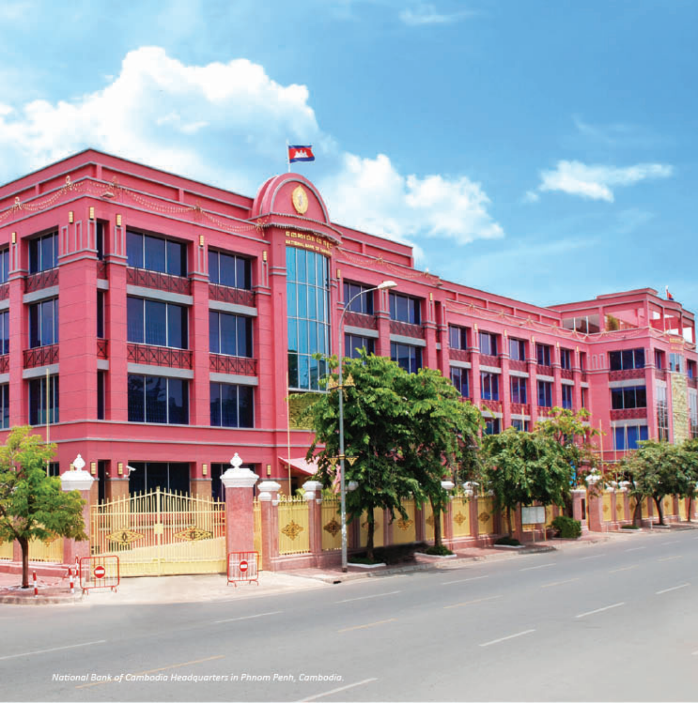
National Bank of Cambodia Headquarters in Phnom Penh, Cambodia.