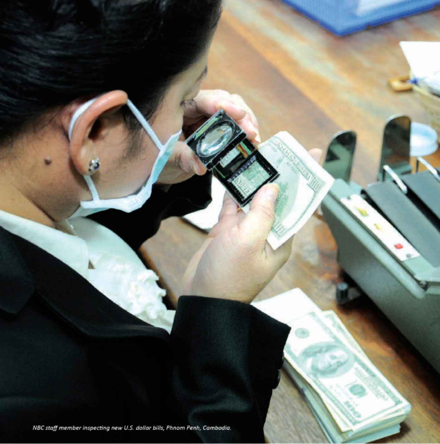
NBC staff member inspecting new U.S. dollar bills, Phnom Penh, Cambodia.