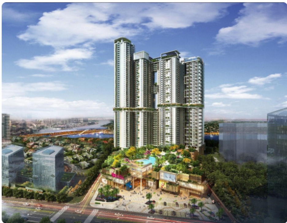
By: Cambodianess -- 📅 19, July 2020 , ⌚ 5:48 AM

Urban Hub Cambodia, a well-known real estate developer behind the award-winning condominium project, Urban Village, announced the pre-launch sales of Sky Prime Building H at an event held on Saturday, 18th July 2020 at Factory Phnom Penh. The event attracted approximately 200 interested attendees who also visited the Urban Village's showrooms, which are located right in the