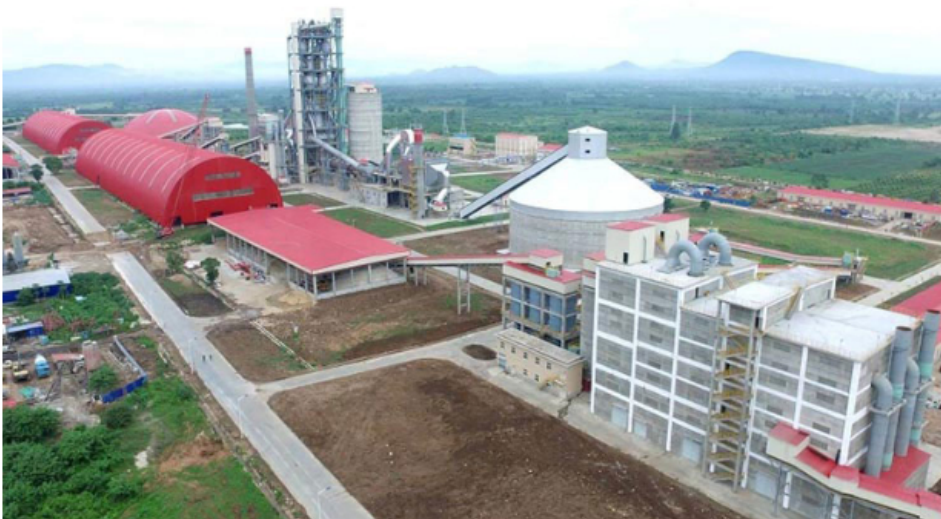
Battambang Conch Cement Co Ltd located in Battambang province is scheduled to begin production shortly. AKP

Click here to get Khmer Times Breaking News direct into your Telegram