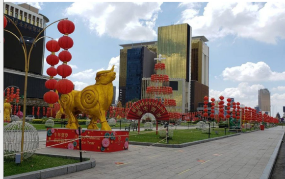
The park in front of Phnom Penh's NagaWorld hotel and casino complex, decorated for Chinese New Year, on March 1, 2021.

[responsivevoice_button voice="US English Female"] After NagaWorld workers began a work boycott over the weekend about employees being kept in the dark about Covid-19 cases at the casino, its owner NagaCorp announced it would act "responsibly and swiftly to volunteer to temporarily suspend its business."