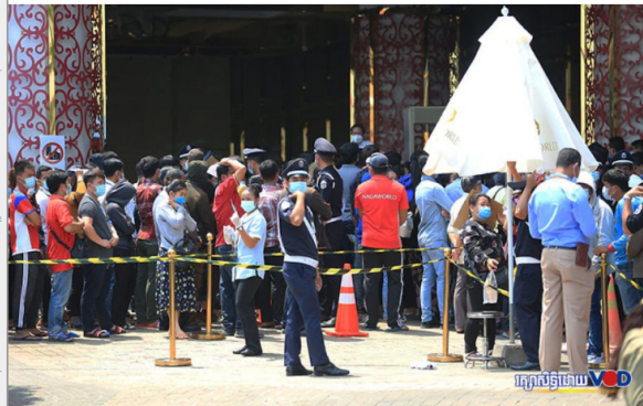
Hundreds of workers crowd outside Phnom Penh's NagaWorld casino waiting to give samples for Covid-19 testing on March 12, 2021.

[responsivevoice_button voice="US English Female"] Hundreds of workers crowded outside Phnom Penh's NagaWorld casino as many returned for their second Covid-19 tests following the discovery of several cases there, a workers' boycott and the suspension of operations last week.