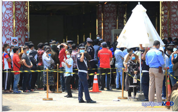
Hundreds of workers crowd outside Phnom Penh's NagaWorld casino waiting to give samples for Covid-19 testing on March 12, 2021.