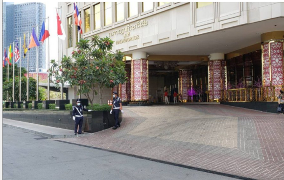
Masked guards stand at the front of Naga 2 in Phnom Penh on March 1, 2021, amid a boycott by thousands of staff after some said they tested positive for Covid-19.