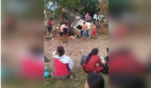
The wrecked truck with garment workers, dazed and wounded sitting on the ground.

Click here to get Khmer Times Breaking News direct into your Telegram