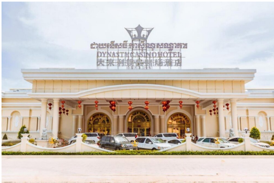
The exterior of Dynasty hotel and casino in Svay Rieng's Bavet city.

20 April 2023 9:35 PM | Eung Sea | Sovann Sreypitch and Jack Brook